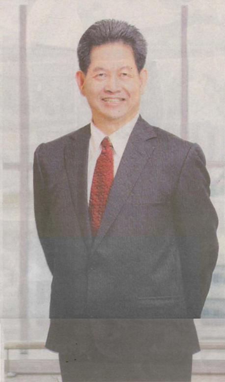
Foo: "As a member of the International Federation of Accountants, the institute adopts and implements the International Education Standards in our education system to ensure that highly qualified, skilled and competent talents are admitted as members of the institute."

The remaining three modules of the MICPA programme will also