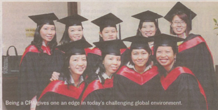
Being a CPA gives one an edge in today's challenging global environment.

ance, enabling them to work in other countries to gain wider experience and personal enrichment and also to participate in a global profession after returning to their own countries and enhancing their ability to contribute to economic development.